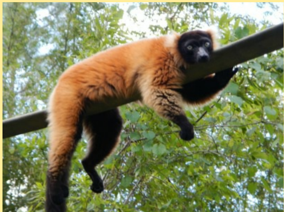
'THE COMFORT BRANCH'